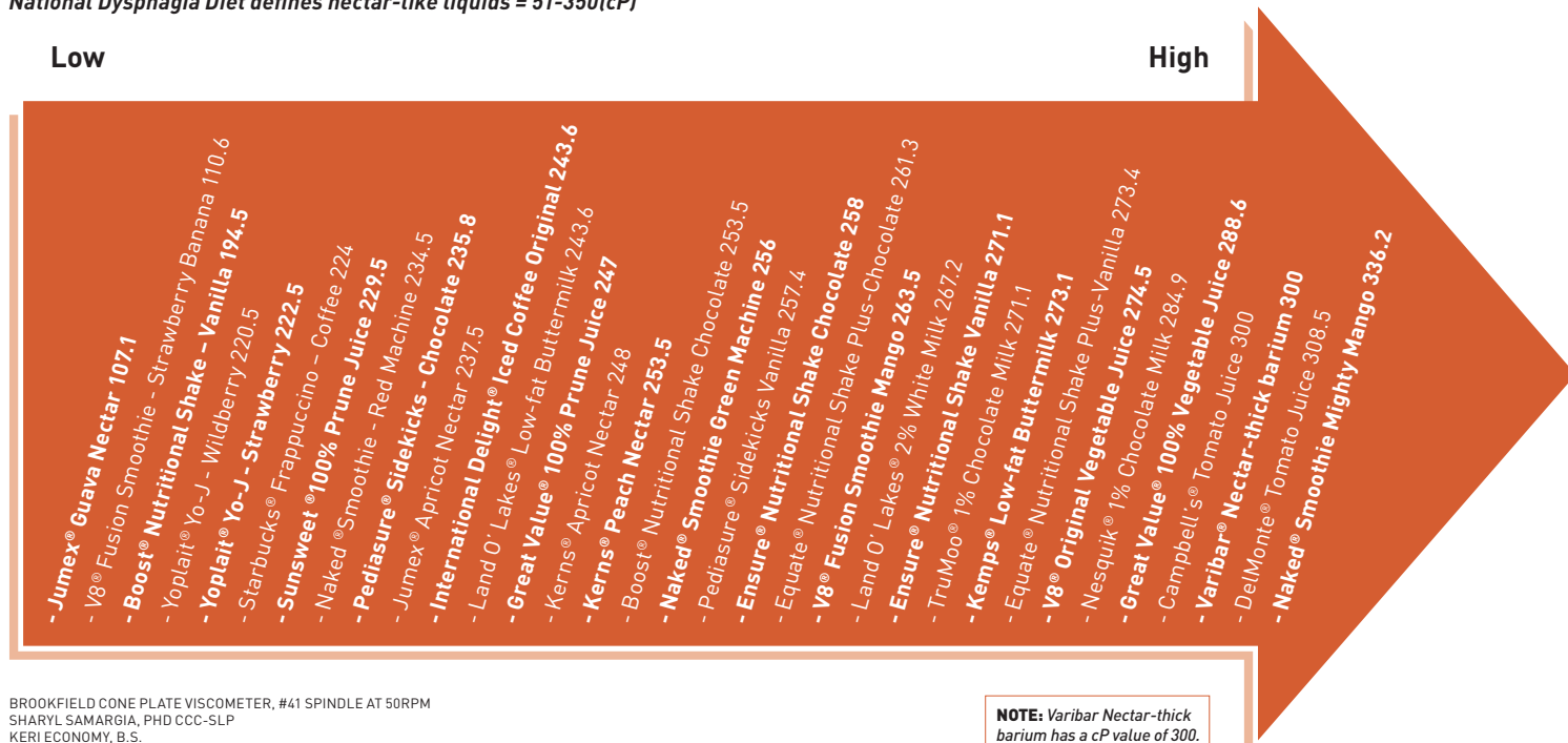
Figure 2 Chilled Beverage Viscosity Range National Dysphagia Diet defines nectar-like liquids = 51-350(cP)